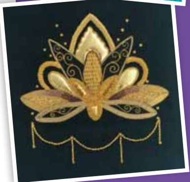
Royal School of Needlework, Apartment 12A, Hampton Court Palace, Surrey KT8 9AU, UK