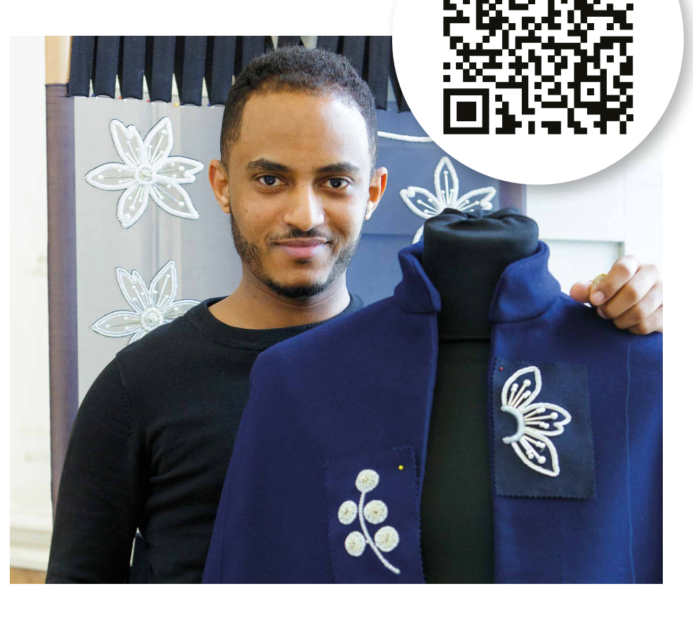
"The RSN is the only institution where students are so thoroughly taught to use and preserve this wonderful craft which is a unique form of artwork and must continue into the future."