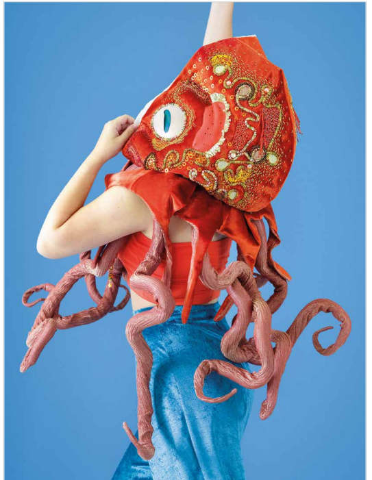
BA (Hons) Hand Embroidery