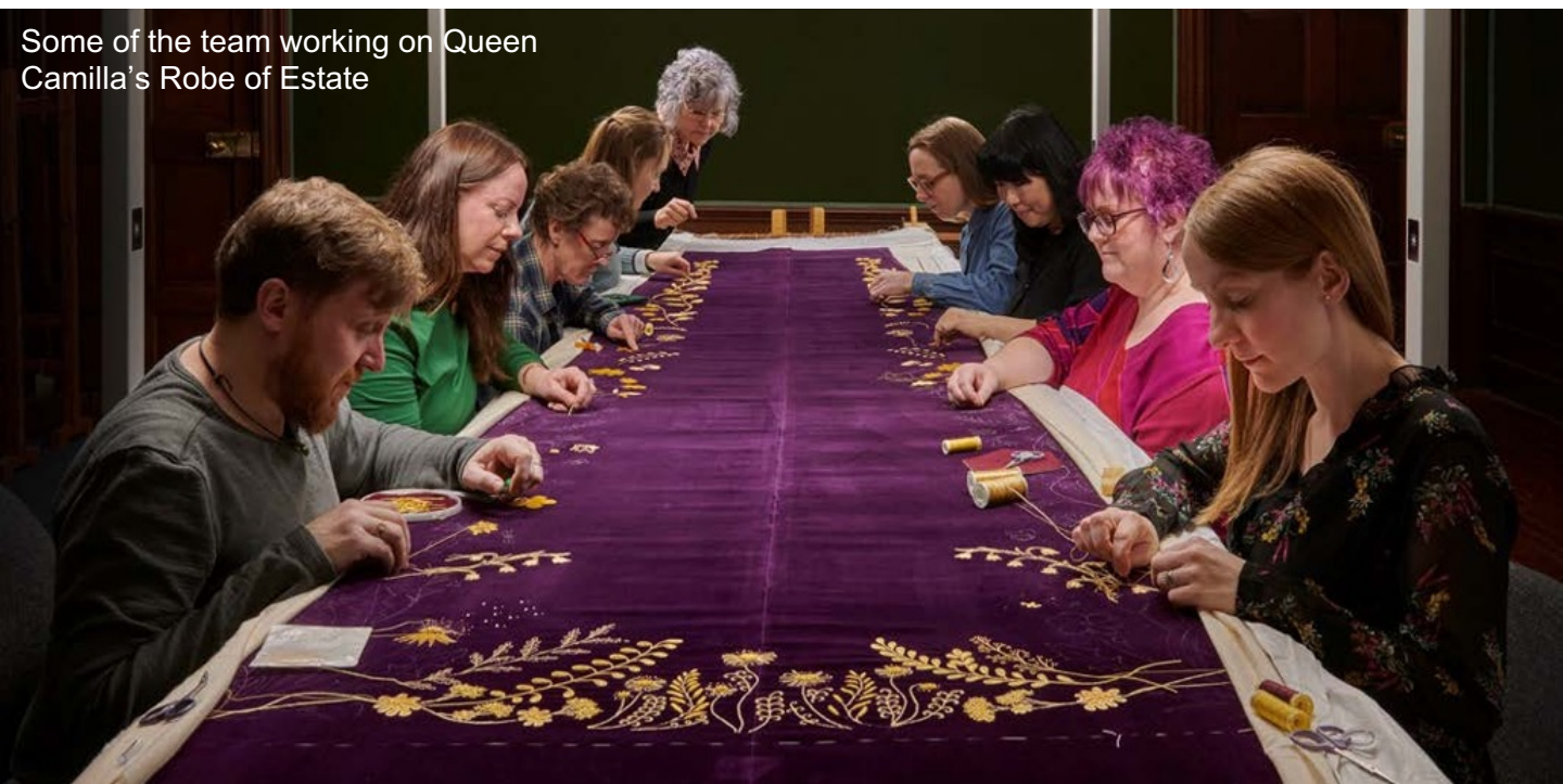
Some of the team working on Queen Camilla's Robe of Estate

We further promote hand embroidery through activities such as exhibitions, talks (live and on demand), introductory taster sessions and schools' projects. Our extensive Archive and Collection helps inform and inspire students and hand embroidery enthusiasts. It comprises thousands of embroidered items and designs collected and donated from all over the world and is a fundamental part of our operation. Access to the collection is currently limited but we are cataloguing items and digitised them to make them available online and we continue to add items as quickly as we are able.