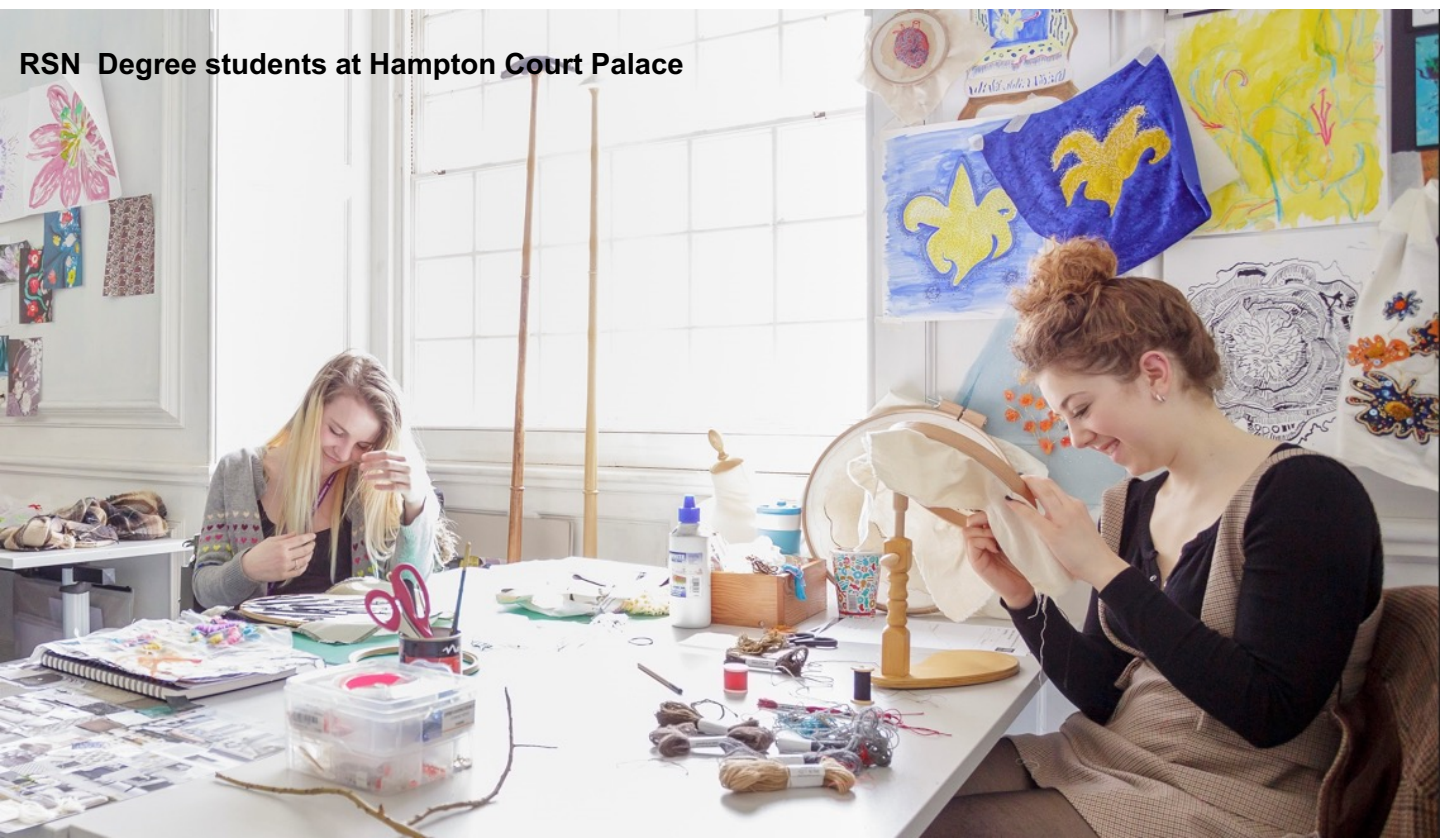
RSN Degree students at Hampton Court Palace

To become an inclusive, public facing, creative world-class institute - the 'go to place' for hand embroidery