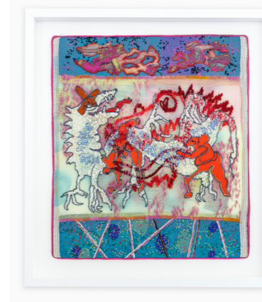
Work by RSN Degree Graduate Imogen Campbell

During the year we filled around 3,000 places across our courses. We taught 15 different techniques across 4 time zones and at 16 locations across the UK. Students and tutors were shortlisted or won 10 'industry' awards.